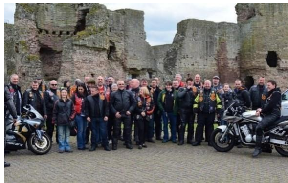
At Rhuddlan Castle