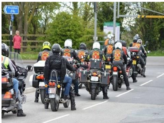
Setting off for the ride to Llandudno

members from the UK and Ireland. It was a pleasure to welcome members from Belgium, Switzerland and Luxemburg and we thank them for making the effort to