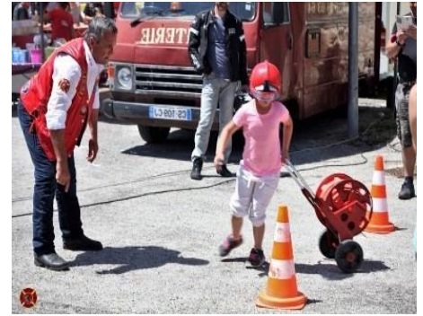
Children trying their hand at some firefighting drills

For the older ones, there was the animation bull "Rodéo", creation of stainless steel objects, leather craftsmen, vinyl musical supports and many other exhibitors!