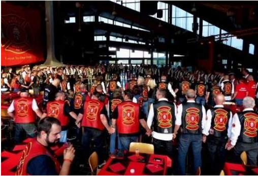
European Knights at the 2016 European Convention