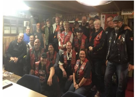
Switzerland 1 and Despatch Riders

Italy, Switzerland, Austria and Germany, the riders arrived in Lucerne on the 26 th where we met for a coffee and some small talk before they continued their ride to Italy. Colonel from Switzerland 2 accompanied them to the Grimsel Pass.