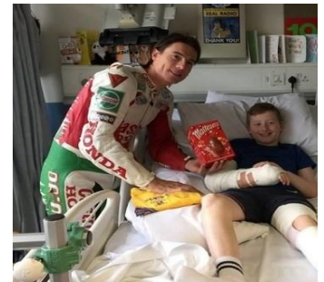
James Toseland giving an Easter Egg to a young patient

The former World Superbike Champion and former MotoGP rider, James Toseland is from Sheffield and is a keen supporter of the Sheffield Children's Hospital Charity, as always he attended with his wife, the singer Katie Melua.