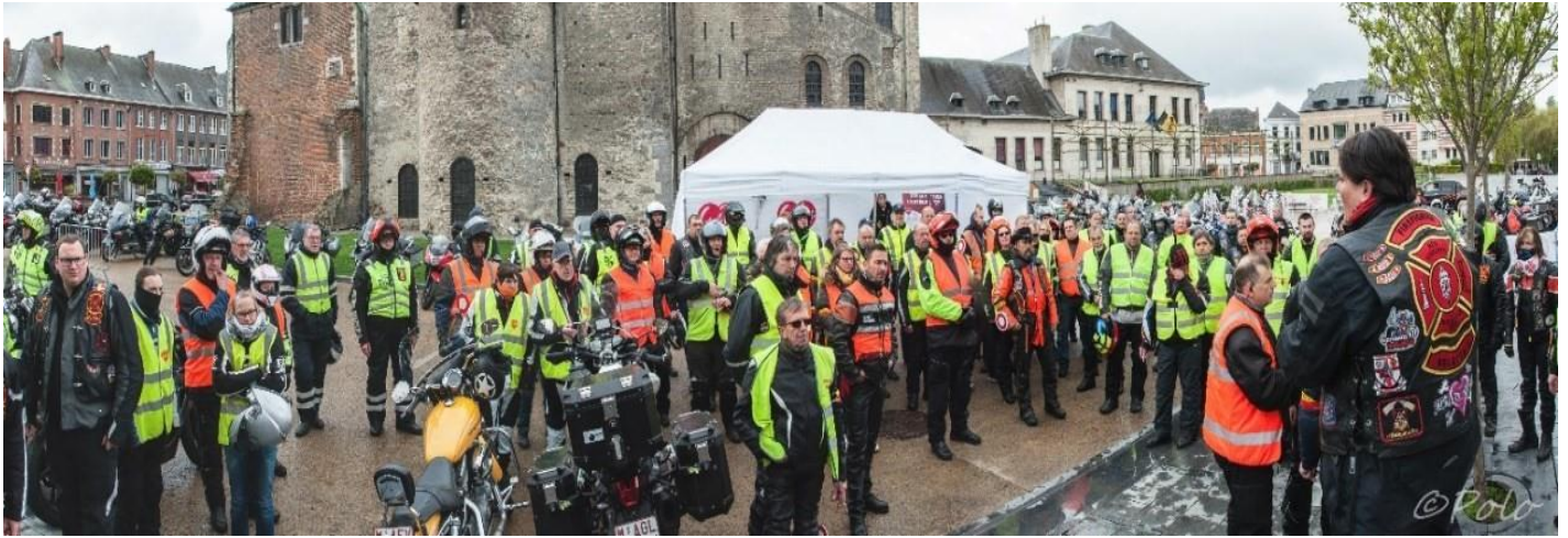
Belgium 4's President addresses the gathering

Since 2012, the Red Knights have assisted with the organising and marshalling of the Télévie rally in Belgium. Télévie was created on the initiative of private television station RTL TVI, which aims to raise funds to advance leukaemia and cancer treatment in both children and adults.