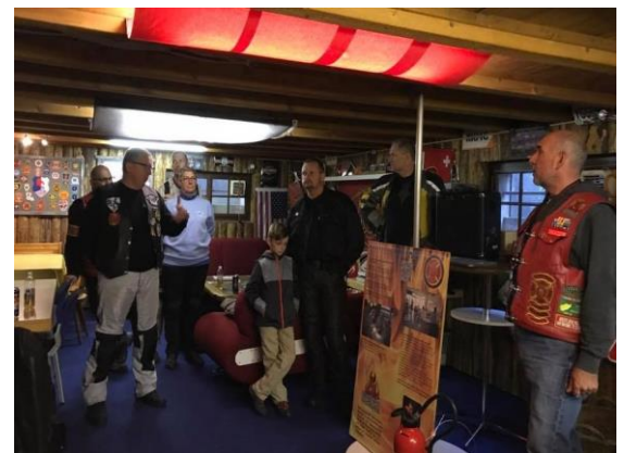
Sharing Experiences at the Clubhouse