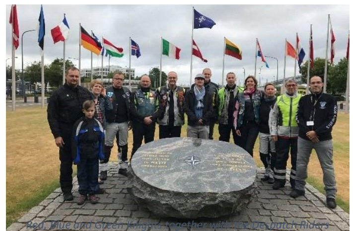
Red, Blue and Green Knights together with the Despatch Riders