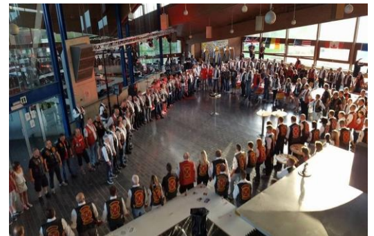
European Knights at the 2016 European Convention

(Since receiving this article we have another new chapter in France – France 6)