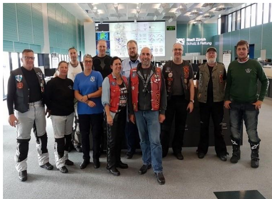
Group tour of the Fire/Rescue Despatch Centre