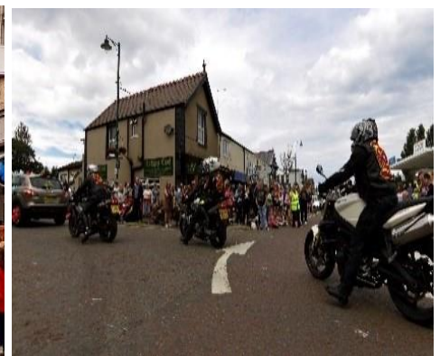
Wales 1 spread the word about the Red Knights at the Prestatyn Carnival