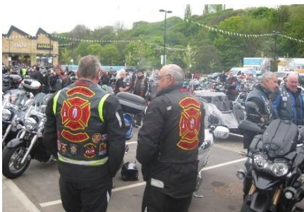
England 2 Ride Captain & Vice President prepare to marshal 500 motorcycles