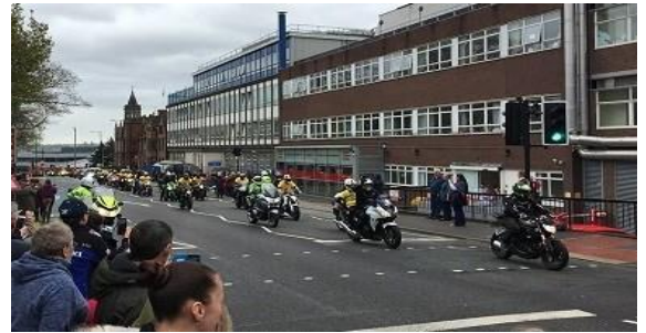
Riders arriving at the Children's Hospital

England 2 have been involved with helping South Yorkshire Police and the Blue Knights with escort and traffic control duties for the annual Sheffield Children's Hospital Egg Run and a Funeral Cortege for a fallen biker.