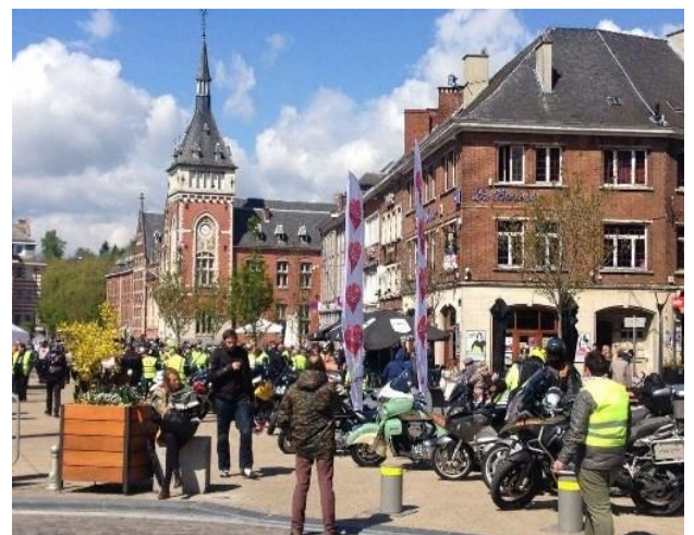
Participants prepare to ride off